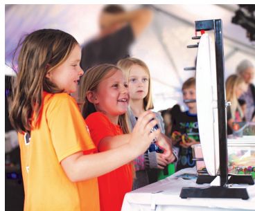
Kids fun at the 20th