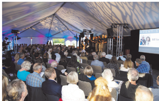
All seats taken at the Pop Up