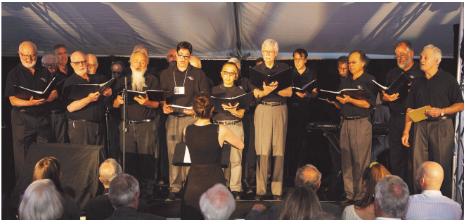
Men's Chorus at the Pop Up