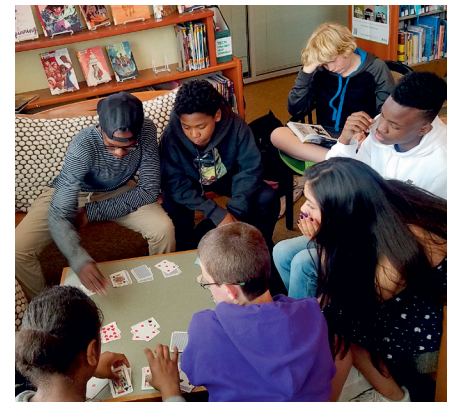
Above: Teens in the former Teen Alcove

As part of the Library's expansion, we are adding a one-of-a-kind Teen Room that is a unique, innovative, dedicated place for teens (students in grades 6-12) that provides materials, space, and technology for recreational and educational activities including, but not limited to, homework, reading and literacy development, socializing, gaming, extracurricular activities, instructor- or librarian-led programming, special events, tutoring, self-expression and creativity, and community engagement. Making it even more special? It will be the only dedicated Teen Library in all of Marin County!