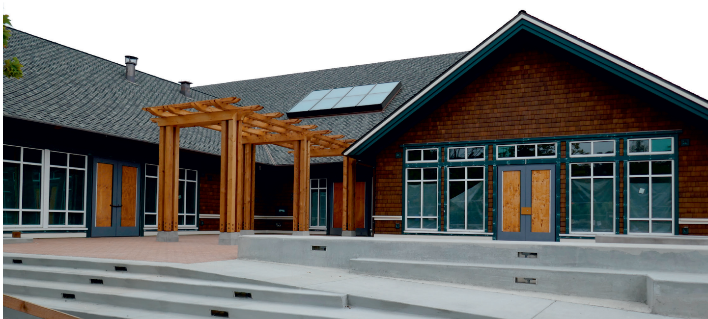
View of the Library Expansion from Tiburon Blvd.