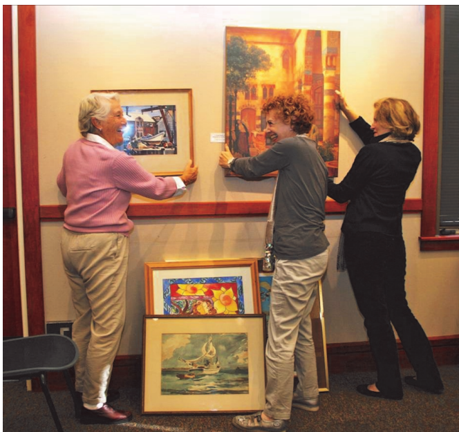
Art Committee members preparing for the 2012 art auction

For those who fall in love with a piece and want to be certain of getting it, a “take it now” price will be listed.