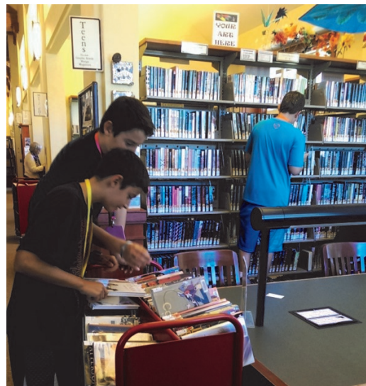
Teen volunteers at work in the Library

Changes this year include a new schedule, enhanced training, a focus on goal-oriented tasks, and name badges so that teen volunteers can be recognized by patrons and peers. These changes will result in increased work quality and a heightened sense of accomplishment, and will allow students to work on their early release days from school.