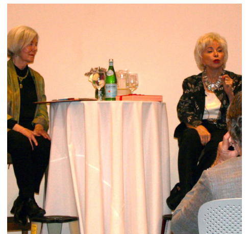
right: Isabel Allende in conversation with Elaine Petrocelli (2023)